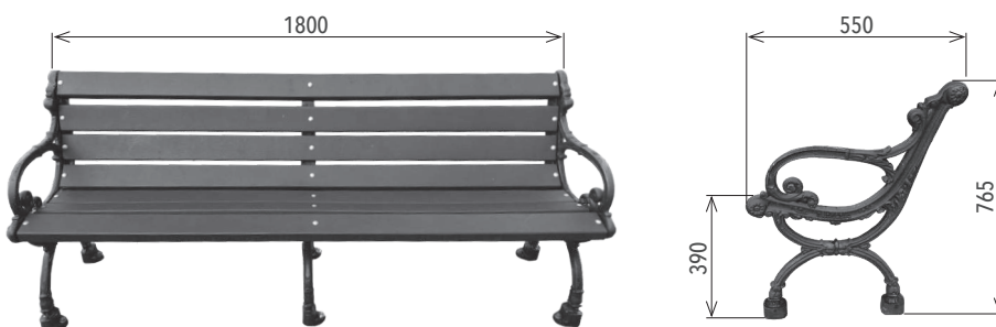
Figure 1: New Yorker Bench Seat with Arms (mm).

The New Yorker Bench Seat is supplied fully assembled and is easily installed by bolting down to a base plate.