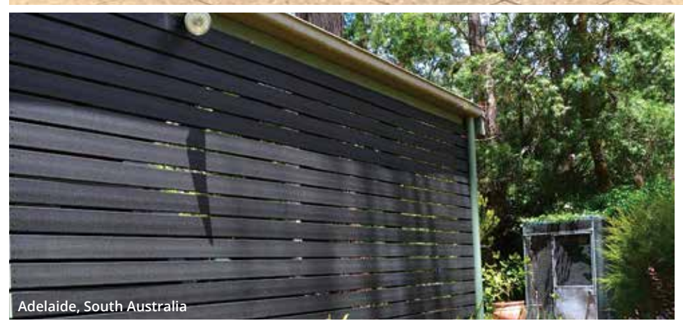
Disclaimer: Due to the use of recycled and reclaimed materials, product colours, shades and widths can vary from time to time.

All composite products shown in this brochure have been designed, engineered and manufactured in Australia by APR Composites – an Australian owned and operated company.