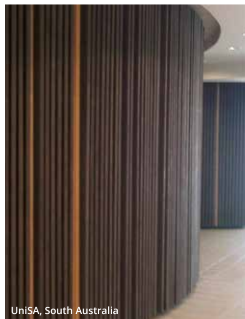
UniSA, South Australia