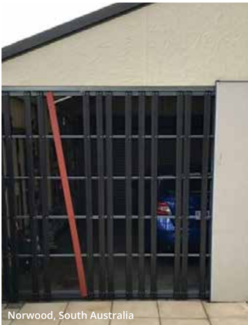
Norwood, South Australia