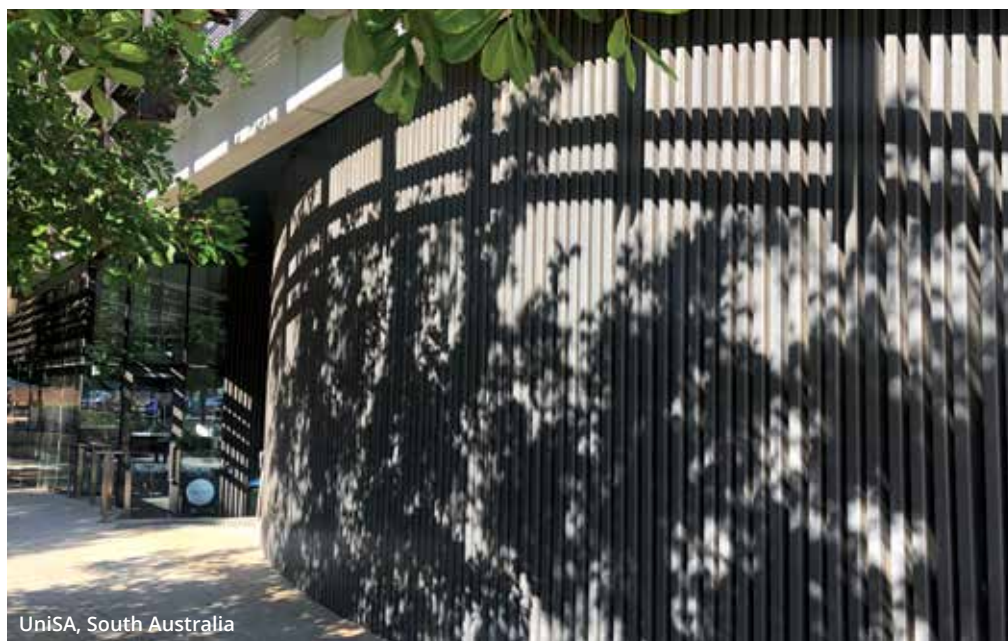
UniSA, South Australia

All APR Composites products are custom designed, engineered and manufactured in Australia to your specific needs, which means you get exactly what you need with no waste . They are also easy to install and require very little maintenance, if any at all.