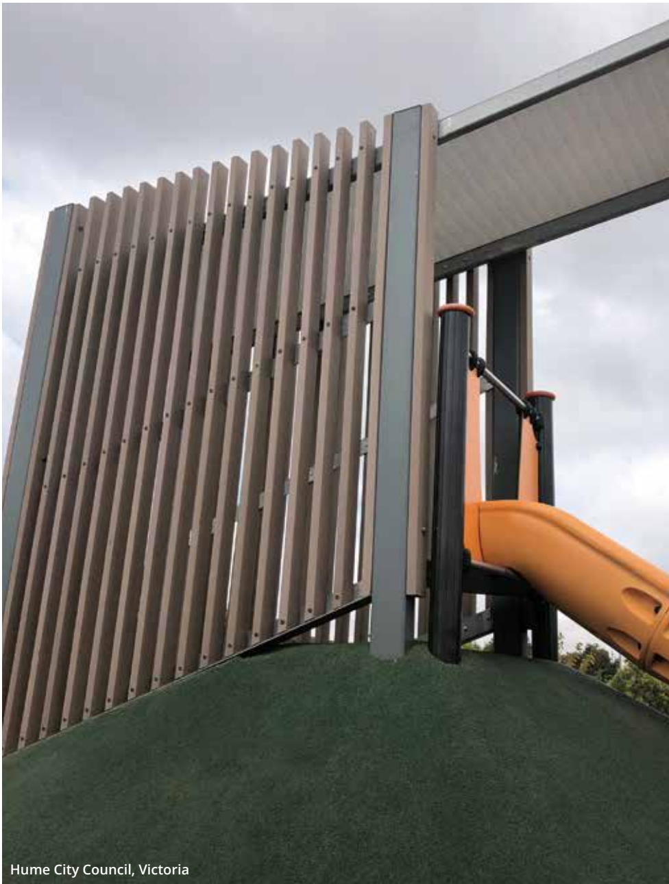
Hume City Council, Victoria