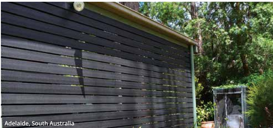
Adelaide, South Australia

Disclaimer: Due to the use of recycled and reclaimed materials, product colours, shades and widths can vary from time to time.