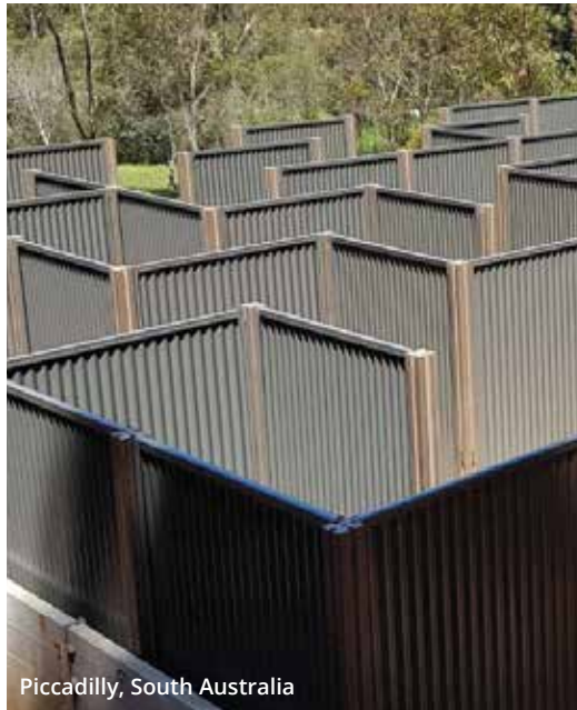
Piccadilly, South Australia