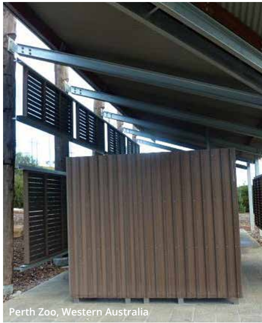
Perth Zoo, Western Australia