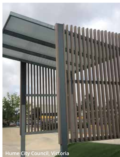
Hume City Council, Victoria