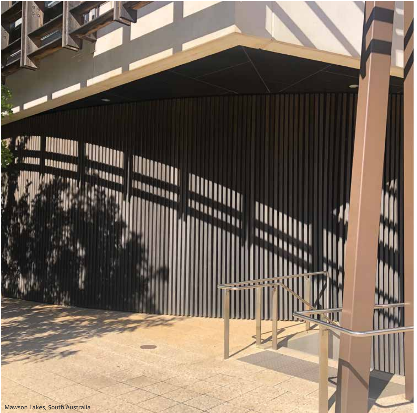
Mawson Lakes, South Australia